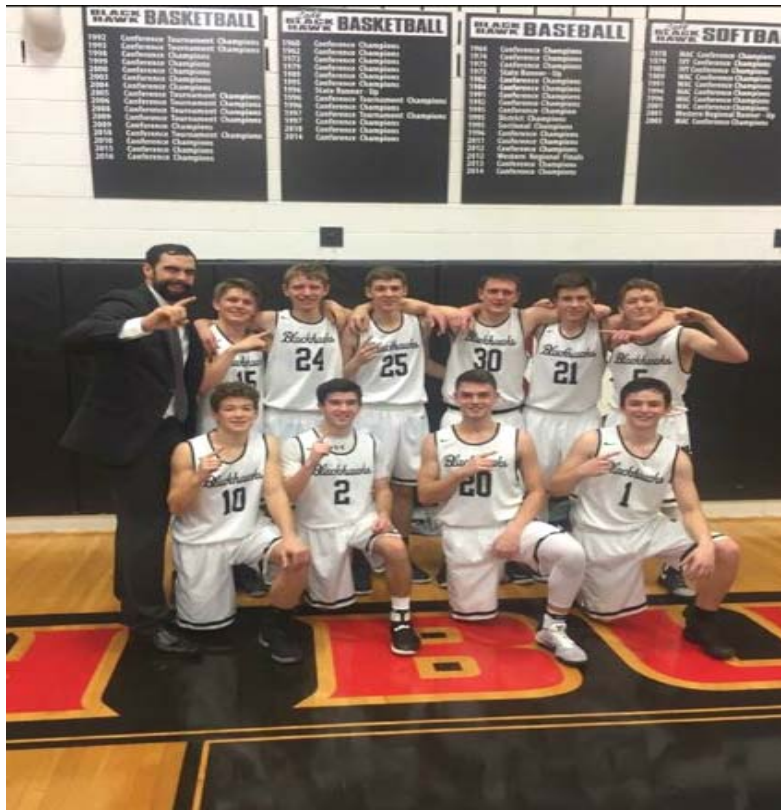
2016-17 North Buncombe Men's Basketball – Mountain Athletic Conference 3A Champions