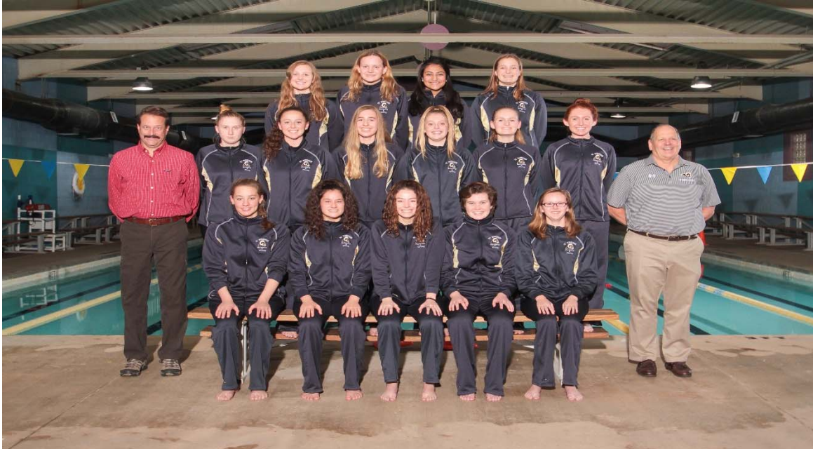
2016-17 Roberson Women's Swimming – Mountain Athletic Conference Champions