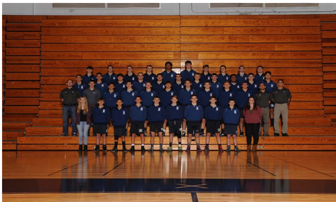
2016-17 Enka Wrestling – Mountain Athletic Conference Regular Season and Tournament Champions