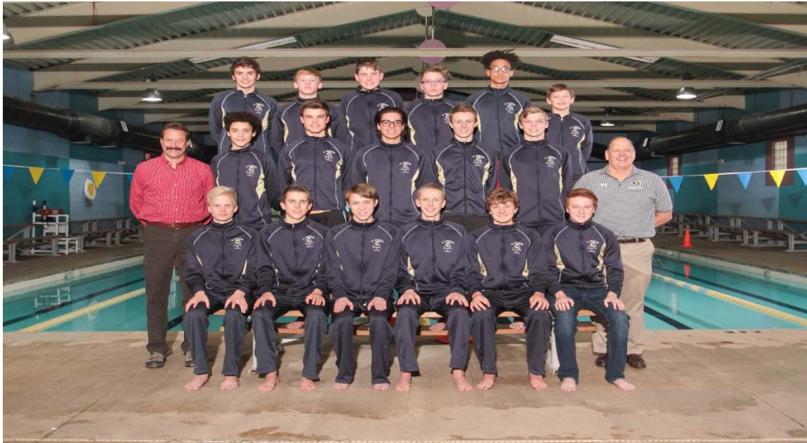
2016-17 Roberson Men's Swimming – Mountain Athletic Conference Champions