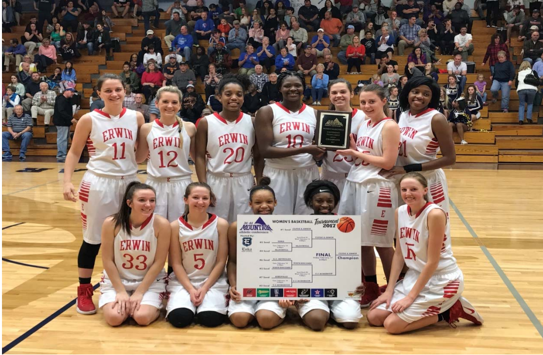
2016-17 Erwin Women's Basketball – Mountain Athletic Conference Regular Season and Tournament Champions