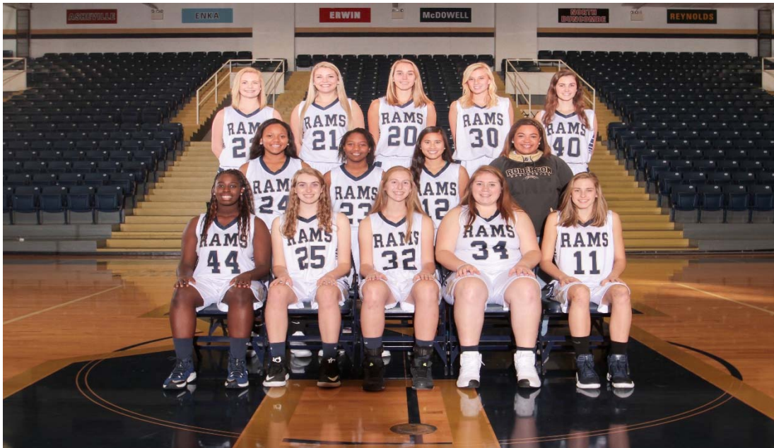
2016-17 Roberson Women's Basketball – Mountain Athletic Conference 4A Champions