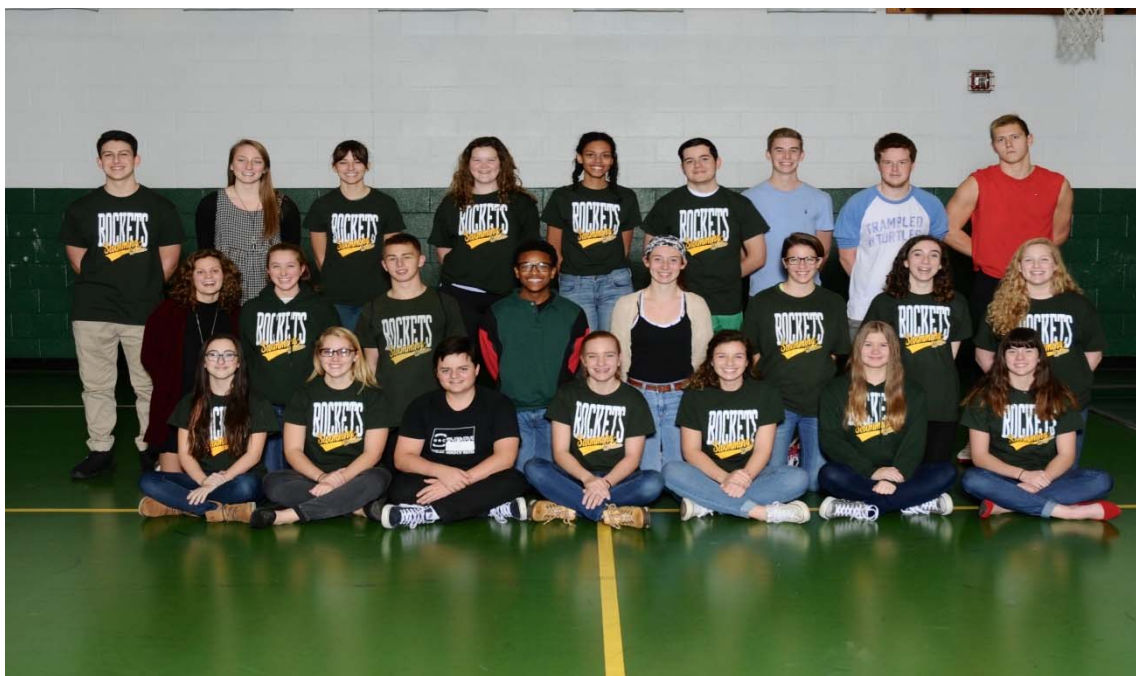
2016-17 Reynolds Men's Swimming – Mountain Athletic Conference 3A Champions